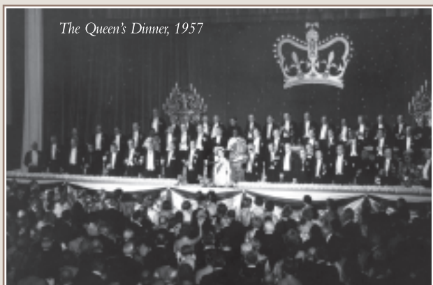
The Queen's Dinner, 1957