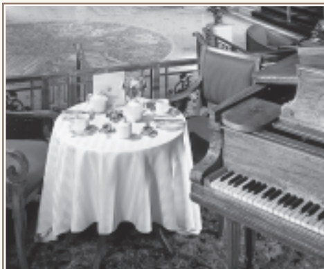
The Waldorf=Astoria presented long-time Waldorf Towers resident Cole Porter with a Steinway Grand Piano. It now resides in Cocktail Terrace, where it is played frequently.