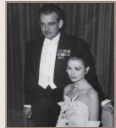
Two of The Waldorf Towers' most noted royal couples were the Duke and Duchess of Windsor (Wallis Simpson and Edward, top left) and Prince Rainier III and Princess Grace of Monaco (top right), shown here during their engagement party at The Waldorf=Astoria. Below is the Presidential Suite, the official New York residence of the President of the United States.