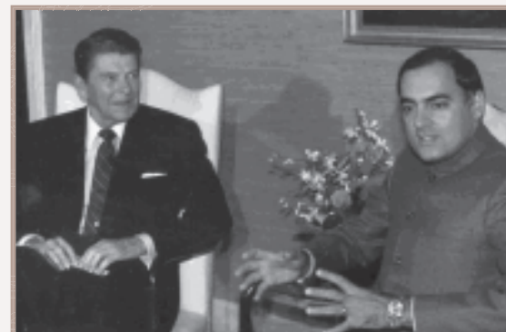
President Ronald Reagan meets with Indian Prime Minister Rajiv Gandhi.