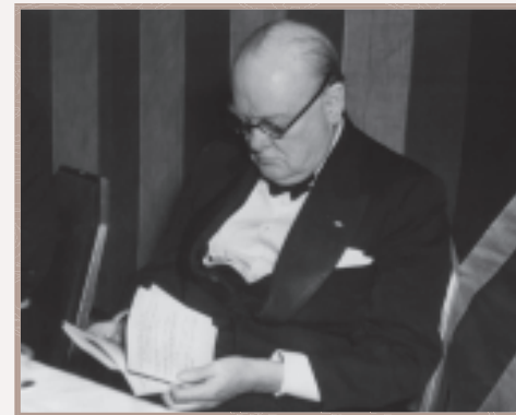
Winston Churchill, in the Grand Ballroom during a dinner in his honor, prepares to respond to critics days after his famed "Iron Curtain" speech.

At The Waldorf Towers, world leaders repose in serene comfort, many choosing the privacy and security of a Towers suite for their most important agendas. In 1946, the U.S., Great Britain, France, and Russia hammered out the details of the WWII peace agreement in a Towers suite, where they also formed the nucleus of the United Nations. Only Buckingham Palace has hosted more heads-of-state, and both the New York residence of the U.S. President and the home of the U.S. Ambassador to the United Nations are located here. Every U.S. President since Herbert Hoover has either stayed in or lived at The Waldorf Towers.