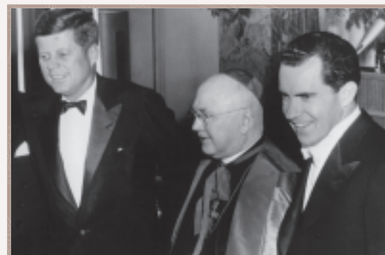
President John F. Kennedy, New York Archbishop Francis Cardinal Spellman, and Vice President Richard Nixon at the Alfred E. Smith Dinner.