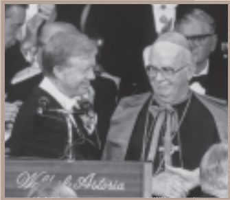
Top: Cole Porter with socialite Elsa Maxwell. Middle: Henry Kissinger with Gregory Peck. Bottom: President Jimmy Carter with New York Archbishop Terrence Cardinal Cooke.

For generations, The Waldorf=Astoria has been synonymous with celebration. One of America's most prominent society events, The International Debutante Ball, was launched in the Grand Ballroom in 1954, and Jacqueline Bouvier took her first bow to society here.